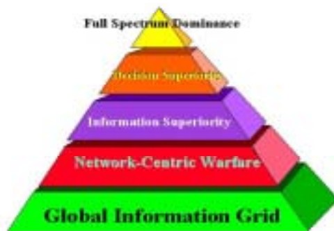
Figure 1 GIG as an enabling foundation. Source: JROCM 134-01, Capstone Requirements Document, Global Information Grid (GIG), 30 August 2001, 1.

its users and includes both DoD owned and leased communications. As the GIG moves from a set of requirements towards implementation as an interconnected system of systems, it will depend heavily on both the national and global information infrastructures. Figure 1 below depicts the building blocks that link the GIG foundation to Information Superiority, and ultimately to Full Spectrum Dominance.